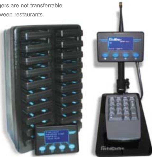
The InfoCube Charging Stand and Attendant Station

The Attendant Station has a forty-five channel capacity. This flexibility allows for up to forty-five paging systems to operate in close proximity without interference. Pagers are not transferrable between restaurants.